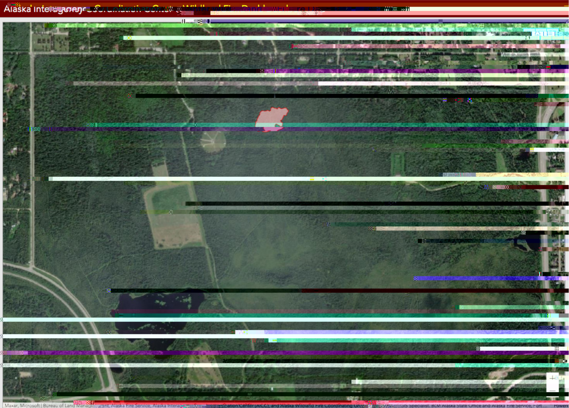
Yankovich Road fire perimeter, 2021.