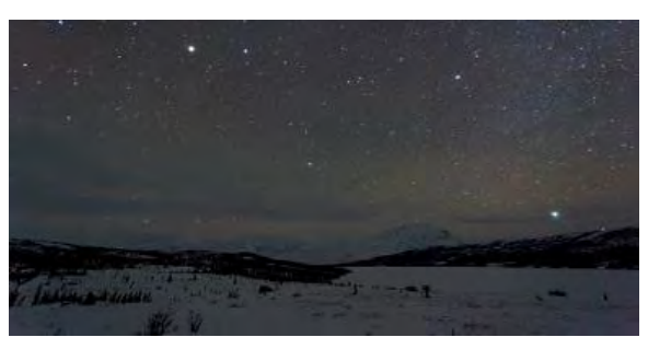
Night sky at Denali National Park.

Astronomy traditions vary across cultures, communities, and individuals. The information collected here is a small sample of how some cultures view the night sky.