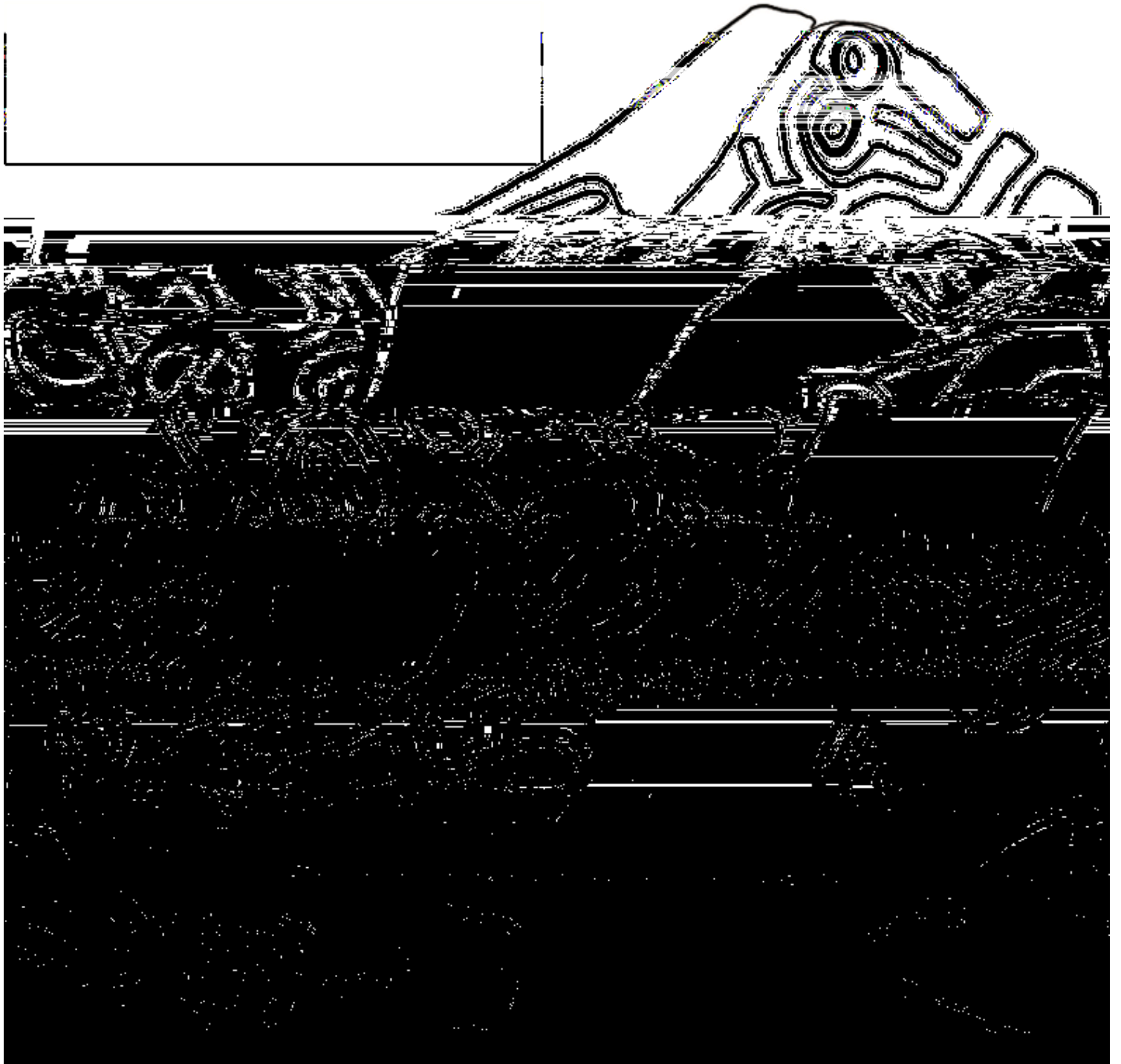
Drawing of the Seal Stone by Mareca Guthrie, Curator of Fine Arts at UAMN.