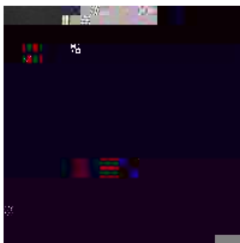
Left: Sketch of 1860 total solar eclipse showing a coronal mass ejection.