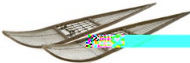
Iñupiaq Snowshoes ( tagluk ), 1887. National Museum of Natural History, E127941