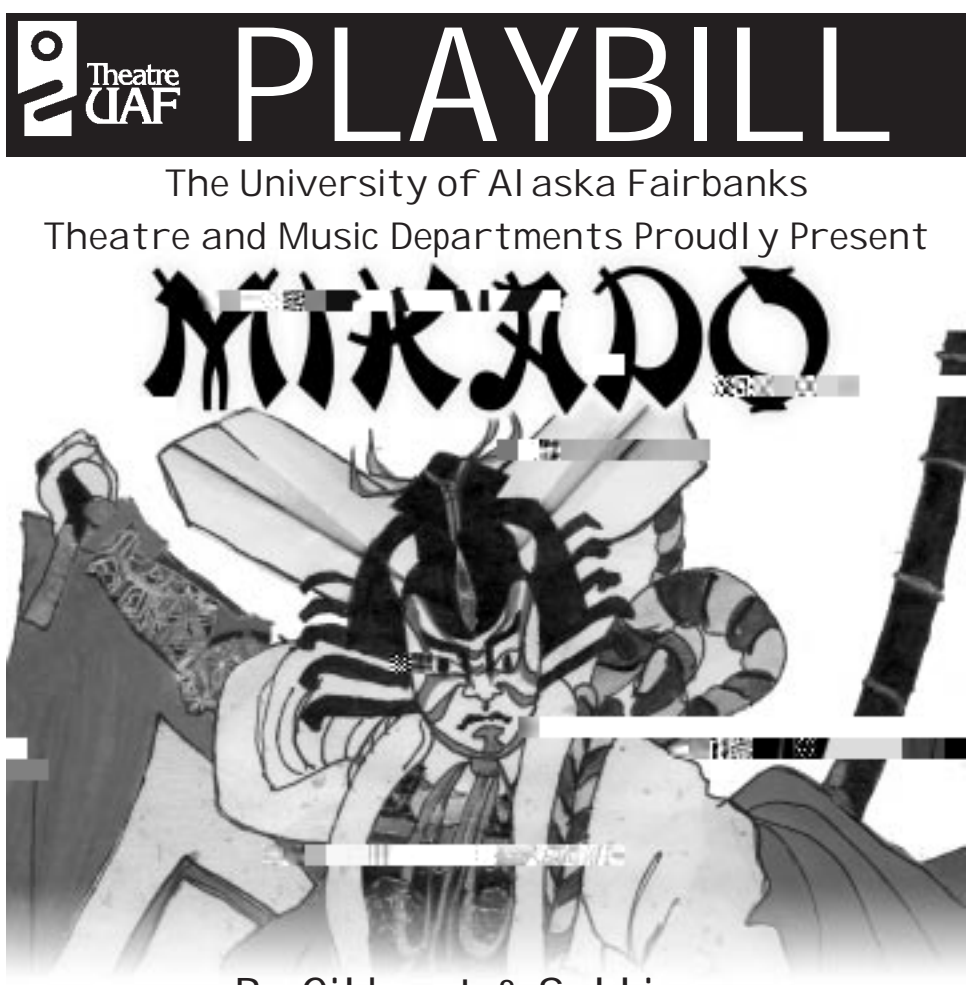
By Gilbert & Sullivan